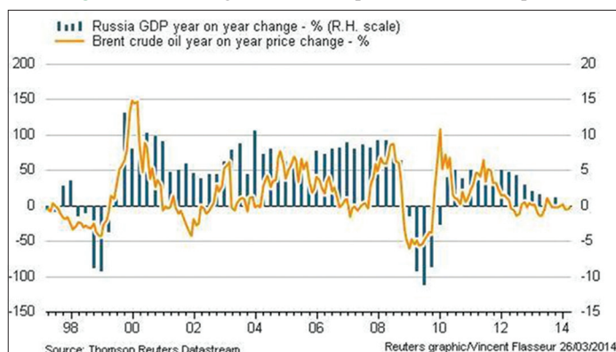
Figure 1: Russian gross domestic product and the oil price

Depreciation of ruble became one of major factors of increase in inflation and, as a result, promoted decrease in real disposable incomes of the population and long-term chilling of the consumer demand. According to the Ministry of Economic Development of the Russian Federation, according to the results of 2015, inflation in Russia has grown to 12.91%. Oil prices fluctuations play a major role in explaining the real exchange rate movements. The main objective of this study is to determine the strength of the dynamic relationship between crude oil price and exchange rate. A good understanding of the nature of comovement of oil prices and exchange rate is crucial for traders and institutional investors.