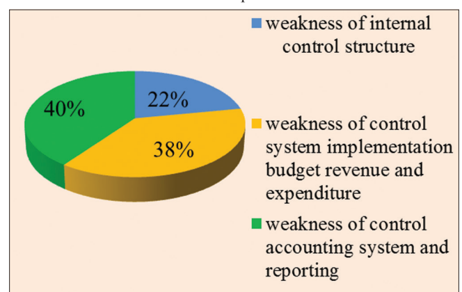
Figure 2: Composition Internal System Weaknesses local Government Financial Reports 2015