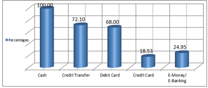
Figure 2: Percentage of houehold payment method ownership

Differences in quality attributes such as the level of payment security, the ease, speed, cost, reward and acceptance affect