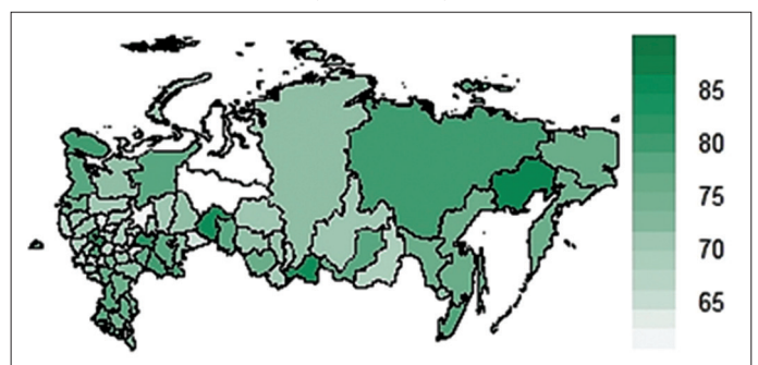
Source: Built by the authors based on Rosstat data. No data are available for the Khanty-Mansiysk Autonomous Okrug, the Nenets Autonomous Okrug, the Yamalo-Nenets Autonomous Okrug, the Republic of Crimea and the city of Sevastopol.