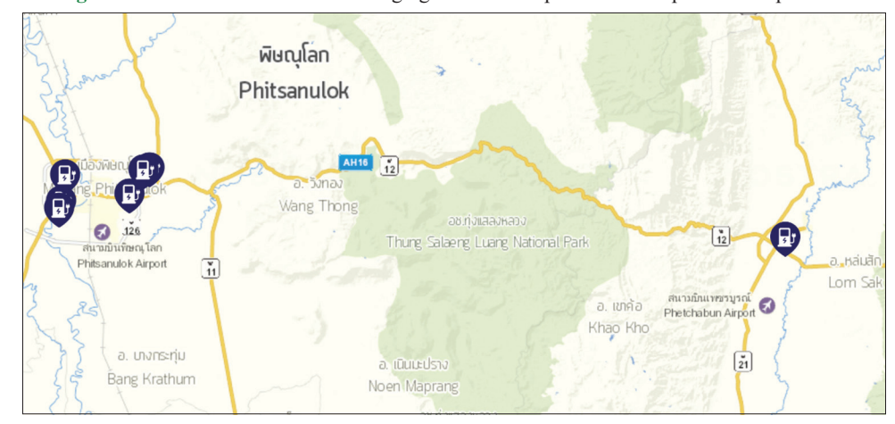
Figure 1: Number and location of charging station from phitsanulok to phetchabun province

approximately 1,280 kilometers through the Indochina Intersection in Phitsanulok Province, and the ASEAN Intersection at Lom Sak District, Phetchabun Province. The number and location of charging station in Khao Kho route presents in Figure 1. Impact CO<sub>2</sub> of using electric cars on tourism routes in Wang Thong District, Phitsanulok Province, to the route Khao Koh District, Phetchabun Province. It was assumed that the number of electric vehicles would increase by 5% with a reduction in CO<sub>2</sub> emissions of 2.88%, but the assumption of an increase in electric vehicles of 10% had a decrease in CO<sub>2</sub> emissions of 5.77%. Based on the data, the more EVs run, the greater the balance in the clean-air environment.