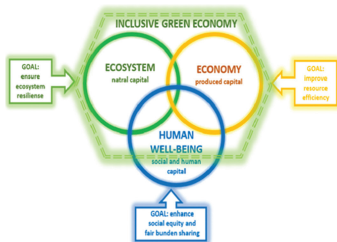
Figure 2: Inclusive green economy

This study aims to examine how the implementation of a sustainable economy—encompassing aspects including green investments, renewable energy sources, forest conservation, access to clean energy, and green employment—affects economic growth and overall well-being in developing nations, alongside