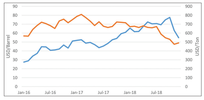
Figure 4: Fluctuation of crude palm oil and crude oil price