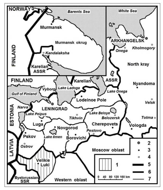
Figure 1: Administrative-territorial division of Northwest Russia in 1929

1. Territory devolved in 1929 r. from the Leningrad Oblast to the Western Oblast; 2. Administrative centers of Oblasts and Krais; 3. Okrug centers; 4. Other settlements; borders and boundaries as of 1929 r.; 5. Of states, 6. Of Oblasts, Krais, republics; 7. of okrugs