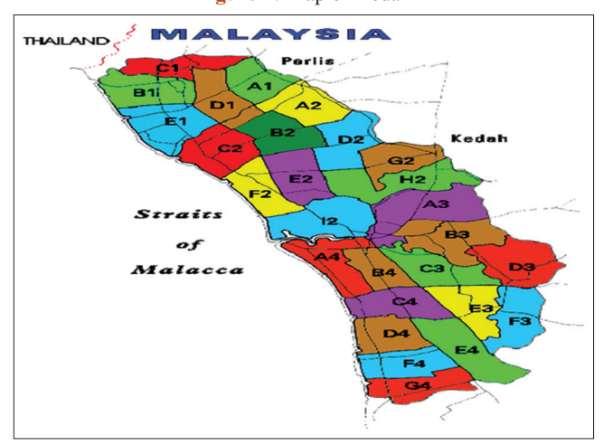
Figure 1: Map of Kedah