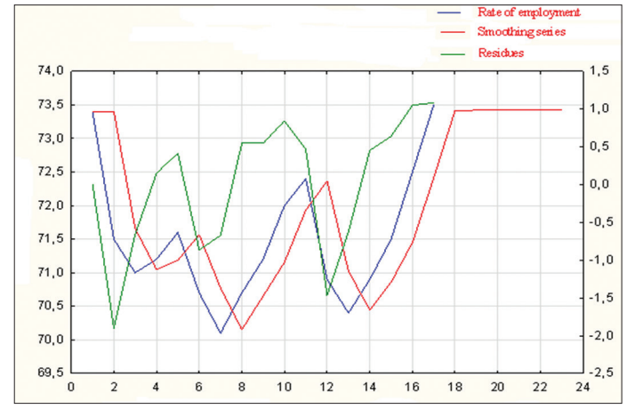
Graph 3: Development of average employment rate